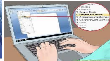
search on the Internet

There are some things you can do to make sure you find the right holiday destination. For example,