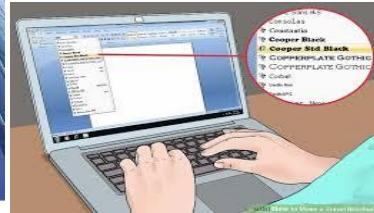
search on the Internet

There are some things you can do to make sure you find the right holiday destination. For example,